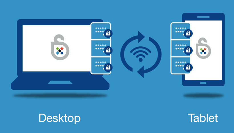
Figure 2: Local sync using Sticky Password

The latest version of Sticky Password introduces secure local synchronization of the encrypted database.